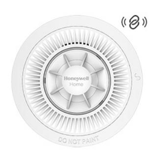
R200H-N Heat Alarm R200ST-N Smoke and Heat Alarm